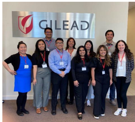
Inaugural Class of 2023