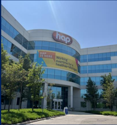
HAP Corporate and site of Detroit Day of Education