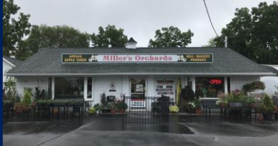
Store from Natalie's mom's website

allow for health plans to absorb these costs within current funding structures, and it would cause significant premium increases if passed on to the public. Natalie feels that this area of this market may require government relief or a new funding model to support access to these treatments.