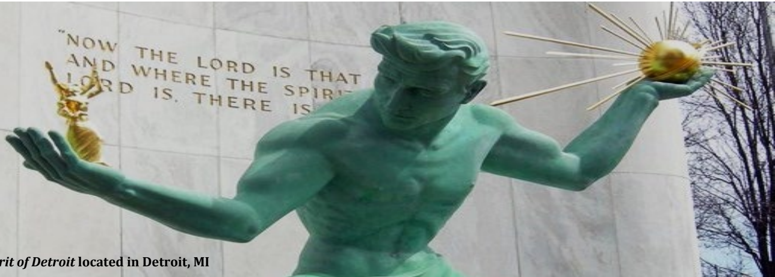
The Spirit of Detroit located in Detroit, MI