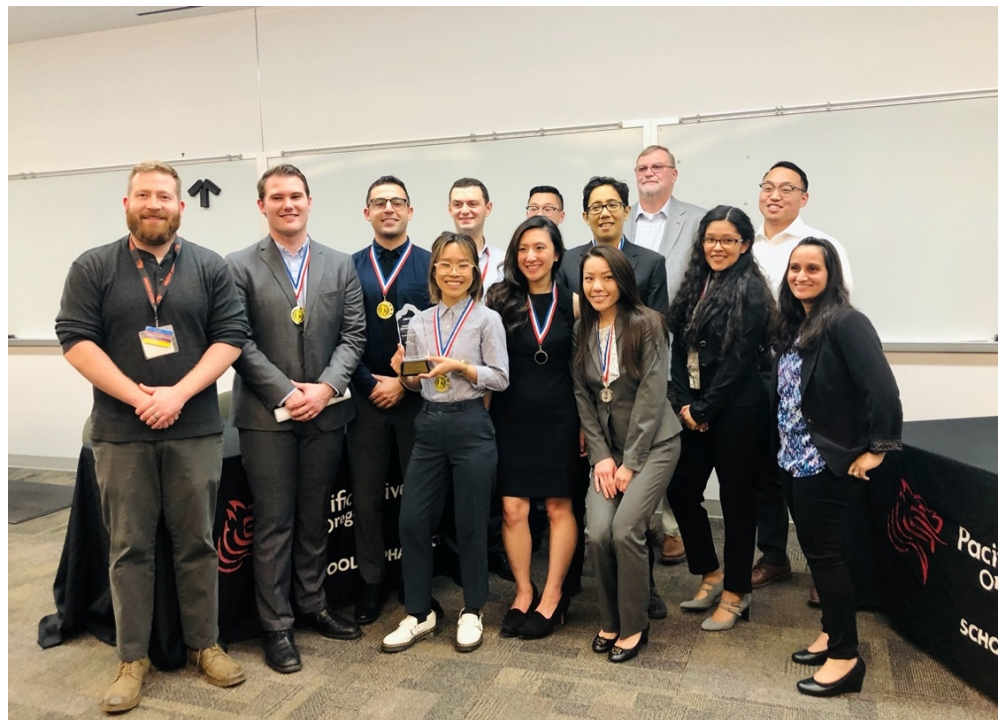
2020 Local P&T Competition (Hillsboro, Oregon)